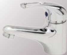
Raymor Piccolo Basin Mixer WELS 6-Star, 4.5L/min $129 [042403]