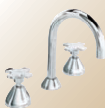
Dorf Petra Basin Set WELS 5-Star, 6L/min $139 [104310]