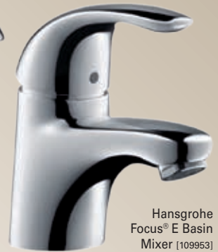
Hansgrohe Focus® E Basin Mixer [109953]

Call 1800-BATHROOM or go to www.tradelink.com.au to find your nearest Bathroom Specialist Showroom!