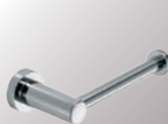
Caroma Cosmo Toilet Roll Holder $19 [071901]