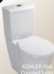
KOHLER Ove Close Coupled Toilet Suite WELS 4-Star, 3.3L avg flush $649 [115453]