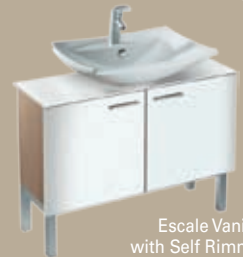
KOHLER Escale Vanity Cabinet with Self Rimming Basin 1000mm $1,999 115088