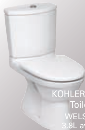
KOHLER Odeon Toilet Suite WELS 3-Star, 3.8L avg flush $549 S [061628] P [061603]