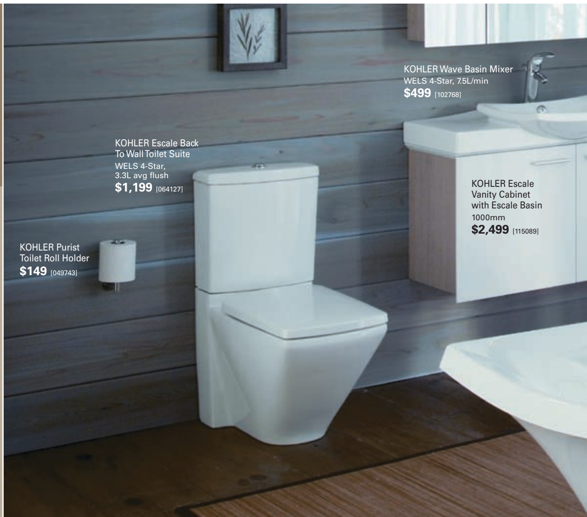
KOHLER Purist Toilet Roll Holder $149 [049743]

“ Going to a retreat can be an expensive way to indulge, especially when a calming haven can be recreated in your own home. Neutral colours, earthy tones and the smooth lines of luxurious products are all you need to bring the resort to your home. The KOHLER® range of bathroom products are sure to provide a memorable bathing experience through quality engineering and ingenuity. ”