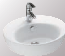
KOHLER Ove Vessel 1 tap hole $249 [115173]