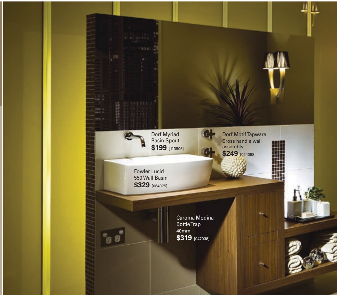
Dorf Myriad Basin Spout $199 [113806]

“ For a modern approach, clever use of lighting and mirrors will set you apart from the crowd. Highlighting key products with a down light will not only show off the finish of each product, but will also allow chrome tapware, accessories and waste grates to sparkle. Large mirrors create a feeling of space within the room, and in this case, allow city lights to seem a part of a luminous bathing experience. ”