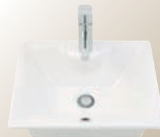
Raymor Topaz Splayed Countertop Basin 1 tap hole, 470x380mm $209 [016674]