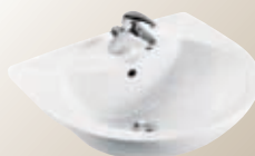
KOHLER Odeon Semi Recessed Basin 1 tap hole $249 [059125]