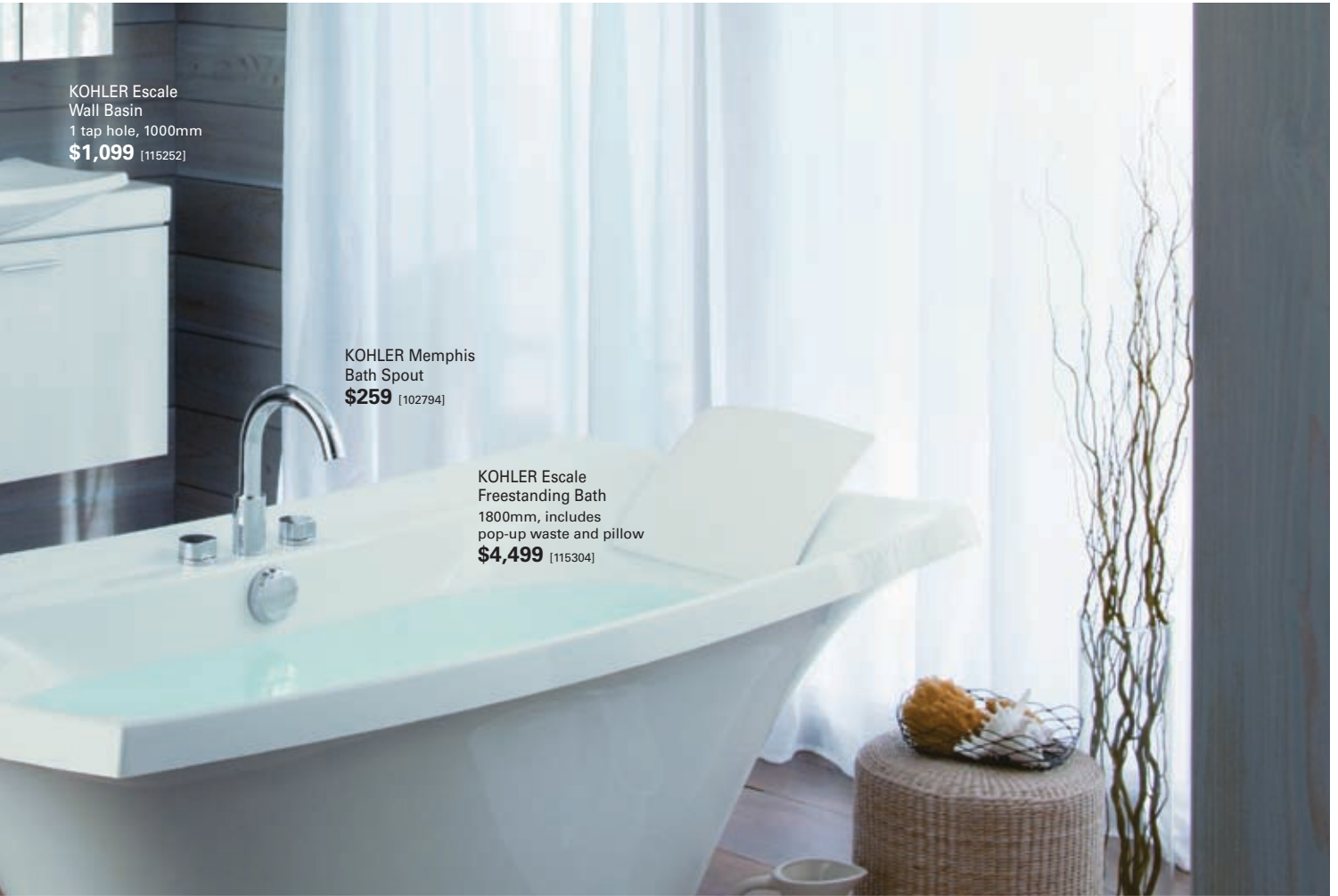
KOHLER Escale Wall Basin 1 tap hole, 1000mm $1,099 [115252]

The innovative style of KOHLER is now exclusively available through Tradelink. With a heritage of excellence, KOHLER offers leading edge design, advanced technologies and renowned craftsmanship to create a truly delightful bathing experience. Dream, imagine and match your ideas with KOHLER bathroomware to create your bathroom, your way.