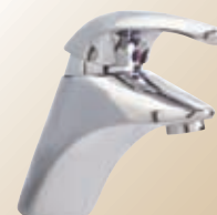
KOHLER Elosis Basin Mixer WELS 4-Star, 7.5L/min $369 [102773]

Tapware and optional chrome wastes pictured with basins not included in prices quoted unless stated. Odeon bath does not include tapware or surround - drop in bath only. Memphis Bath Spout price does not include handles/tapware (tapware not available in Australia).