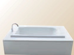
KOHLER Odeon Bath 1675mm $459 [115240]