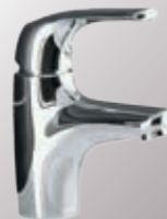
KOHLER Nateo Basin Mixer WELS 4-Star, 7.5L/min $329 [102777]