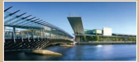
Entertainment and Convention Centre, Melbourne

Found in all the best places, Raymor has been honoured with a permanent display in Sydney's Powerhouse Museum, as well as installations into Australian landmarks such as the Melbourne Entertainment and Convention Centre and Parliament House. Synonymous with superb engineering and design innovation, it's no surprise Raymor is a premier choice for architects, builders and homeowners across Australia.