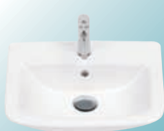
Caroma Altisse Semi Recessed Basin $189 1TH [055500] 3TH [055511]