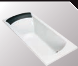
KOHLER Ove Bath 1700mm, includes pop-up waste and pillow $559 [115161]