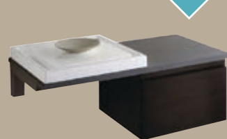
KOHLER Purist Vanity Composite stone top, wet surface basin. Bowl sold separately $5,199 LH [115086] RH [115087]