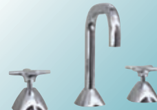
Dorf Fluid Basin Set WELS 5-Star, 6L/min $339 [103935]