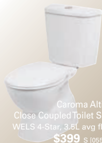
Caroma Altisse Close Coupled Toilet Suite WELS 4-Star, 3.5L avg flush $399 S [055490] P [055491]