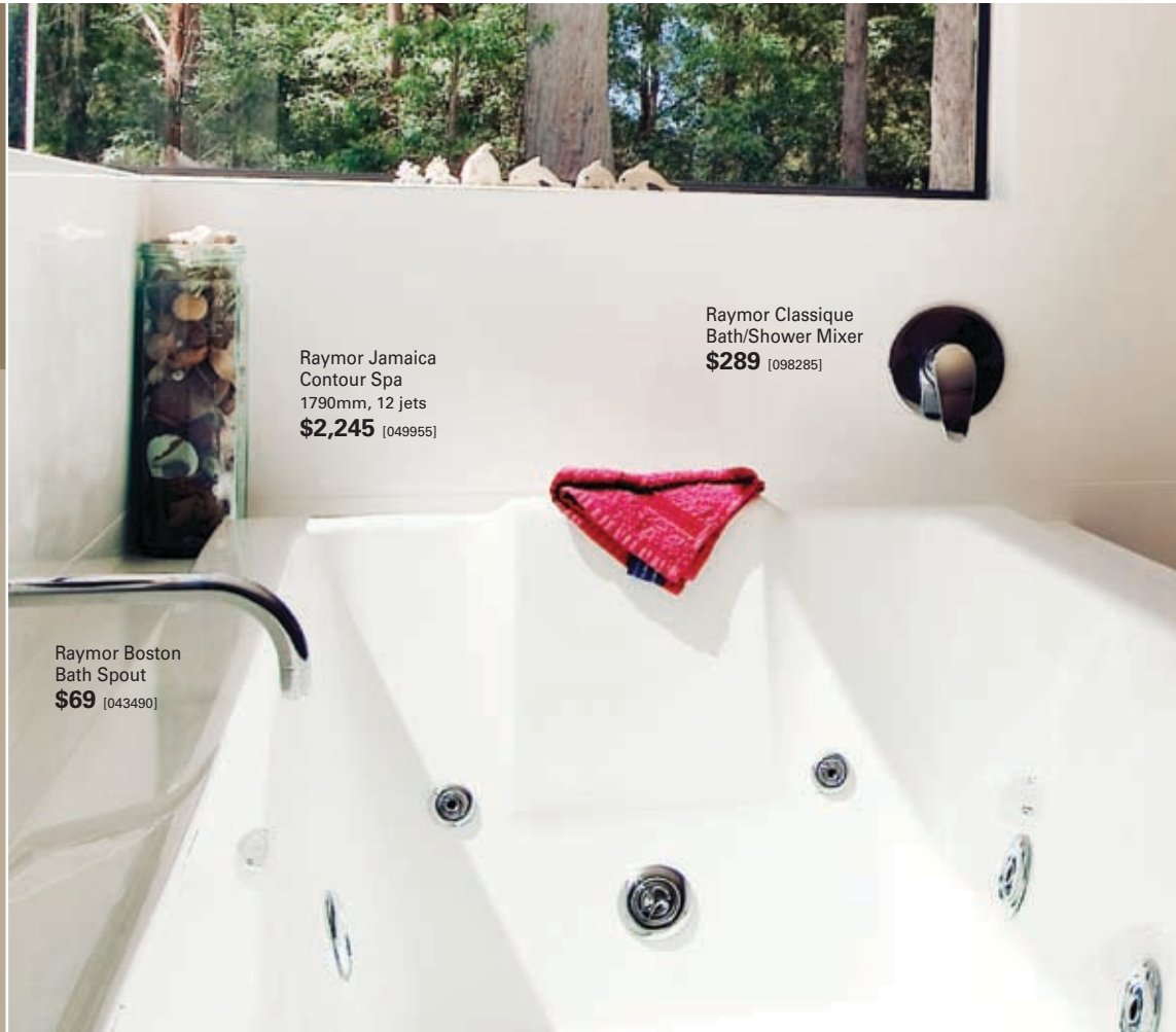
Raymor Jamaica Contour Spa 1790mm, 12 jets $2,245 [049955]

“ When choosing a vanity, keep in mind the different basin options available for your particular unit. Many vanities offer a wide selection of basin options such as semi-recessed, vessel or countertop, but may only allow for a mixer rather than a three-piece tapware set. Prior to purchase, check the position of the water inlet and waste outlet in your home. If they are currently placed in the floor, they will have to be moved to the wall in order to utilise a wall hung vanity. ”