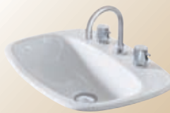
Fowler Regent Vanity Basin $199 1TH [057705] 3TH [057721]