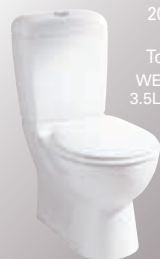
Caroma Opal 2000 Close Coupled Toilet Suite WELS 4-Star, 3.5L avg flush $599 [056922]