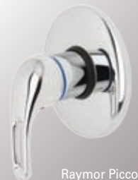
Raymor Piccolo Bath/Shower Mixer $119 [042409]

Tapware pictured with basins not included in prices quoted unless stated. Mixer and accessories pictured with Alpine vanity sold separately.