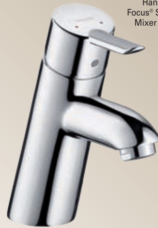
Hansgrohe Focus® S Basin Mixer [109950]